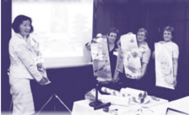
Presenting HEIA Simply Gorgeous posters to their hosts in Japan