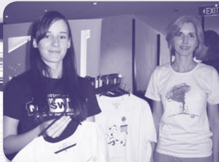
The presenters modelling their ethical fashions