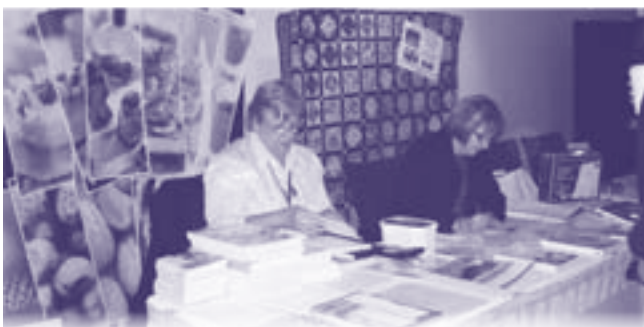
At the HEIA table at the HEIA(Q) state conference