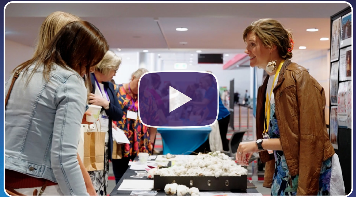
HEIA(Q) 2023 conference showreel

Together, let's nourish the networks that foster resilience, equity, and wellbeing, enriching lives and creating healthier communities for generations to come.