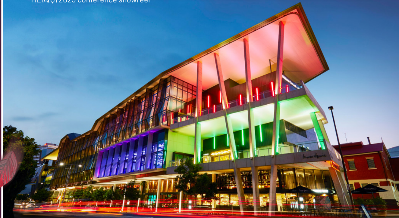
Brisbane Convention & Exhibition Centre